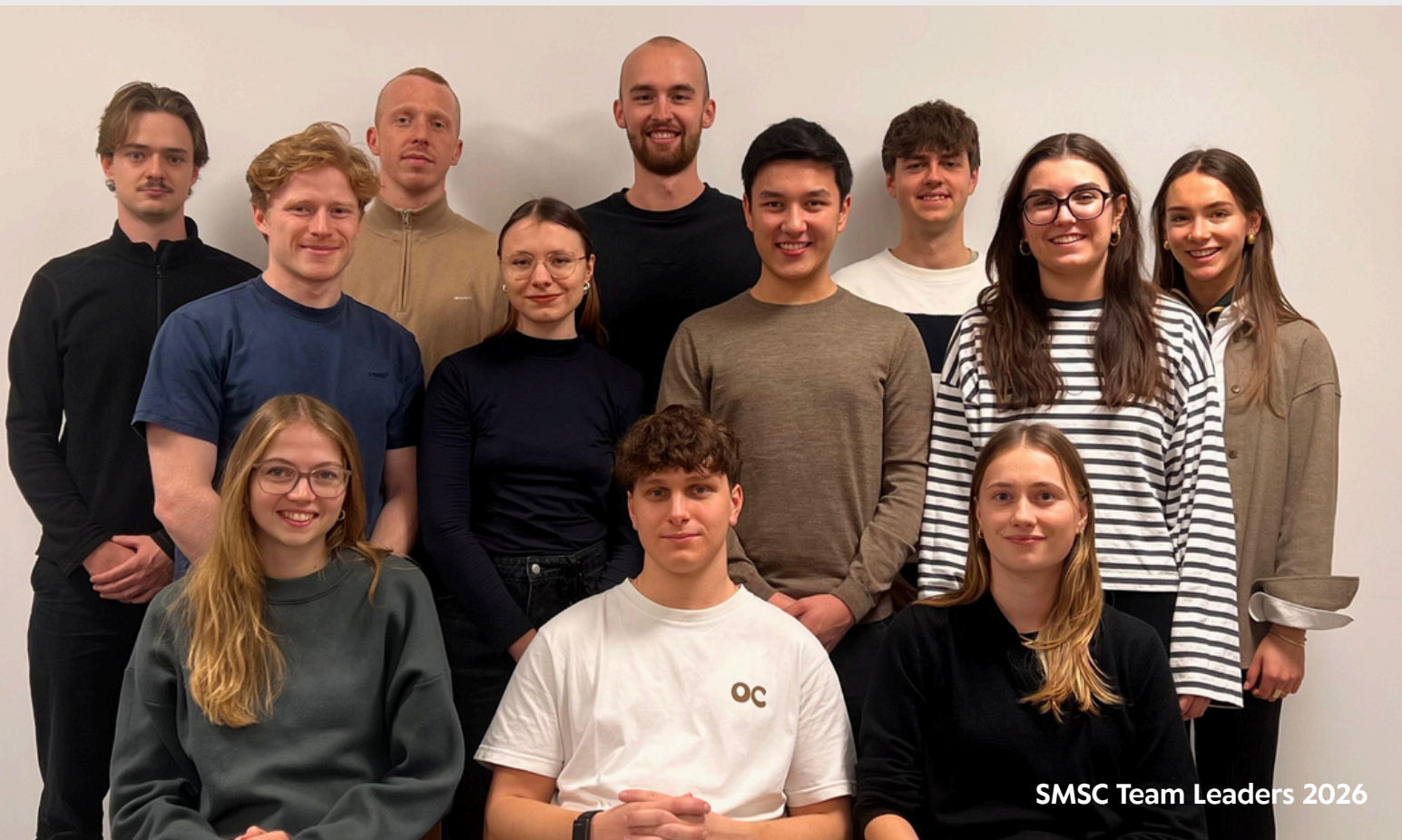
SMSC Team Leaders 2026

The Swiss Medical Students' Convention (SMSC) 2026 is dedicated to a question that concerns us all: "Who cares?!" . The Swiss healthcare system is a constant topic in politics, the media and public debate. How well this system functions is crucial for the quality of care we can provide to our patients one day. Yet during medical school, the system itself often remains in the background. The SMSC 2026 offers a sharp and concise overview of the structures, responsibilities and relationships that define the system in which we will one day work. Join us in Bern for three days of learning, exchanging ideas and connecting with medical students from all over Switzerland.